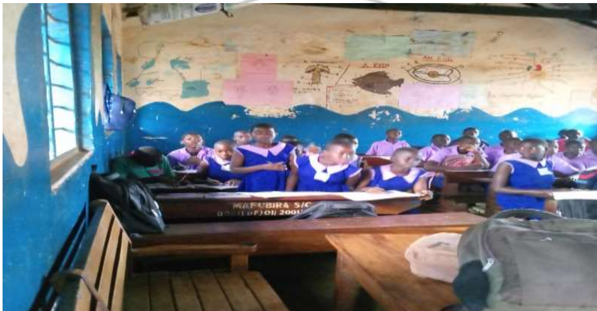
Figure 7: Kids in the classroom