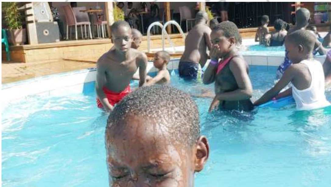
Figure 5: The kids swimming.