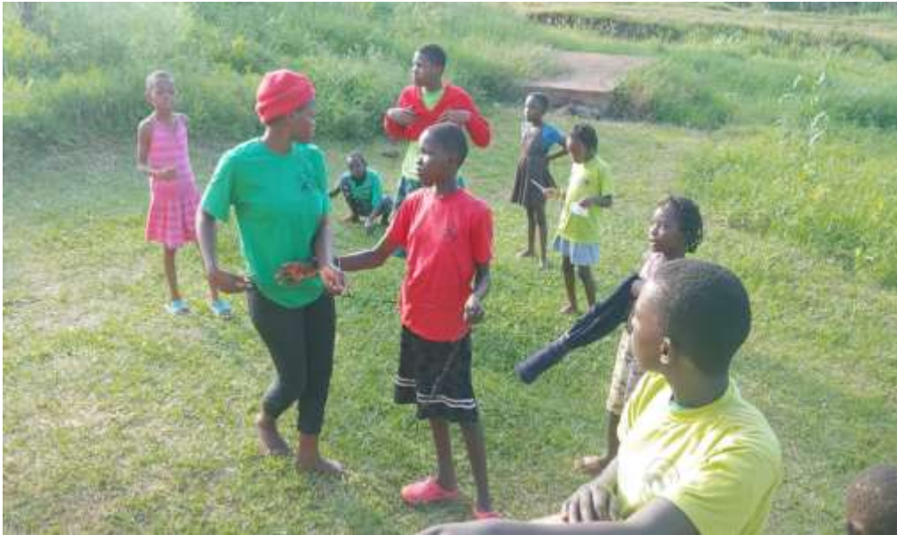
Figure 2: The children playing some games