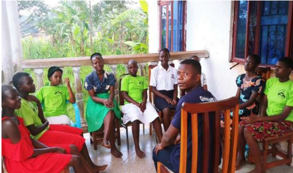
Figure 4: The Kids under Bible studies