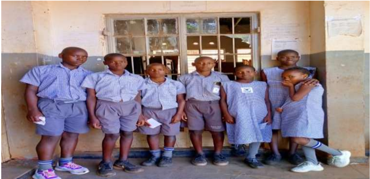
Figure 8: Kids pose for a photo